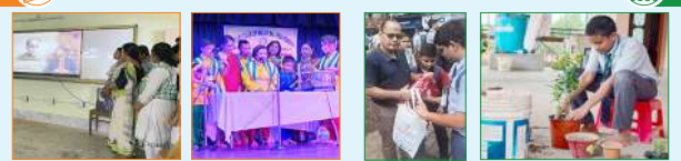
Digital blackboard donated to a school