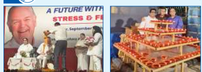
A Future with Stress & Fear