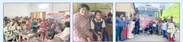
Girls being informed the benefits of Cervical Cancer Vaccination