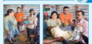
Distribution of food and clothes