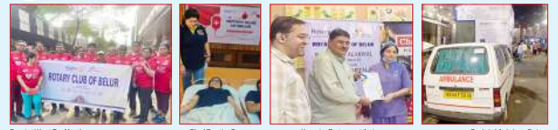
Organised Heart Day Marathon