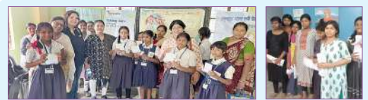
Serving female child health by providing Cervical Cancer vaccination at various schools